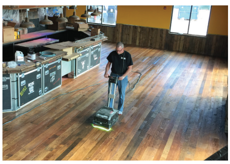
DiamaPro UV-HS for wood.

cured at any temperature, requires no primer coat, and has an extremely long shelf life. Certified DiamaPro UV Systems installers are available nationwide. Comprehensive, hands-on factory training in surface preparation, coating application and curing ensures efficient, high quality installation.