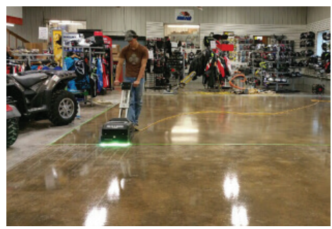
DiamaPro UV-HS being cured with a Bulldog.

DiamaPro UV HS Plus is a clear, single component protective coating for concrete floors that cures instantly with a UV light. Diamapro UV HS Plus enhances the gloss level of your floor by filling in the pore structure of the concrete reducing light refraction. In addition, Diamapro UV HS Plus increases the effect of concrete dyes creating a large spectrum of color options.