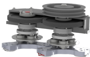
Robust gears to drive tool plates