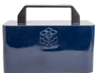
30lb front weight