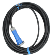
75 feet of 8 gauge extension cord