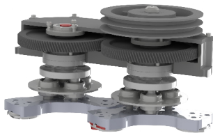
Robust gears to drive tool plates