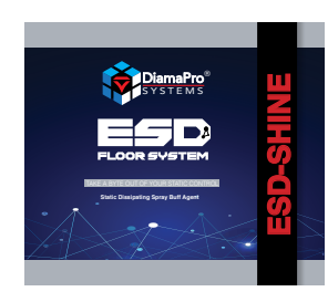
DIAMAPRO ESD SHINE

DiamaPro® ESD-Shine is an ESD floor spray buff solution formulated to be used with a high speed electric or propane powered bunisher. This proprietary formula is enhanced with special lubricats to reduce overheating while burnishing. DiamaPro Diama-ESD Shine provides a high luster and a mirror like finish to not only DiamaPro Diama-ESD System but to all types of hard ESD flooring surfaces including ESD tiles, ESD sheet vinyl, ESD floor paint and ESD epoxy/urethane systems.