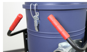
EASY AND DURABLE MOBILITY HANDLES