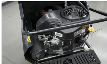
LX600 17HP PROPANE ENGINE