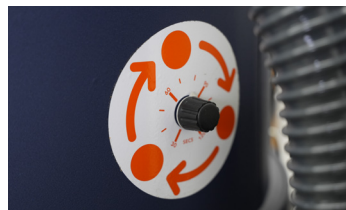
AUTOMATIC FILTER CLEANING WITH ADJUSTABLE INTERVAL TIMES