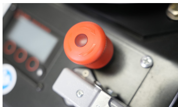
EMERGENCY STOP WITH TWIST RESET