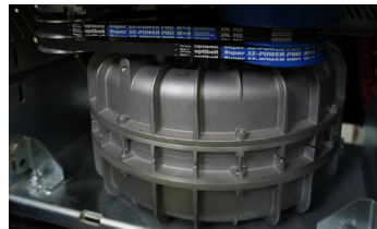
DUAL V-BELT TURBINE DRIVE