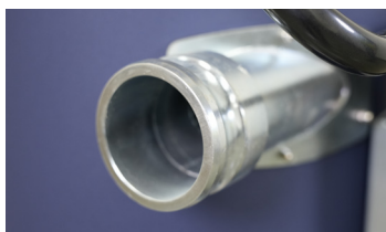
LARGE 3" INLET