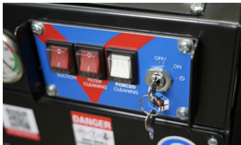
EASY ON/OFF SWITCH WITH LOCK OUT TAG OUT CAPABILITIES