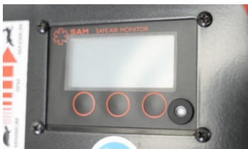
INTEGRATED SAM (SAFE AIR MONITORING) UNIT