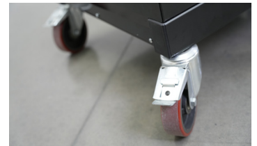
DURABLE, LOCKABLE CASTERS